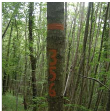
Marking of a target plant using paint (orange ring around 1.5 m from the ground).

toiese forest also contained plants in the mature stage (6) (14%).