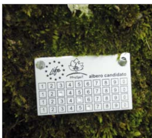
Numbered metal plate affixed to the base of the stem of each target plant identified during Phase 2.

planning models at a compartment scale, to spread the use of this method as widely as possible.