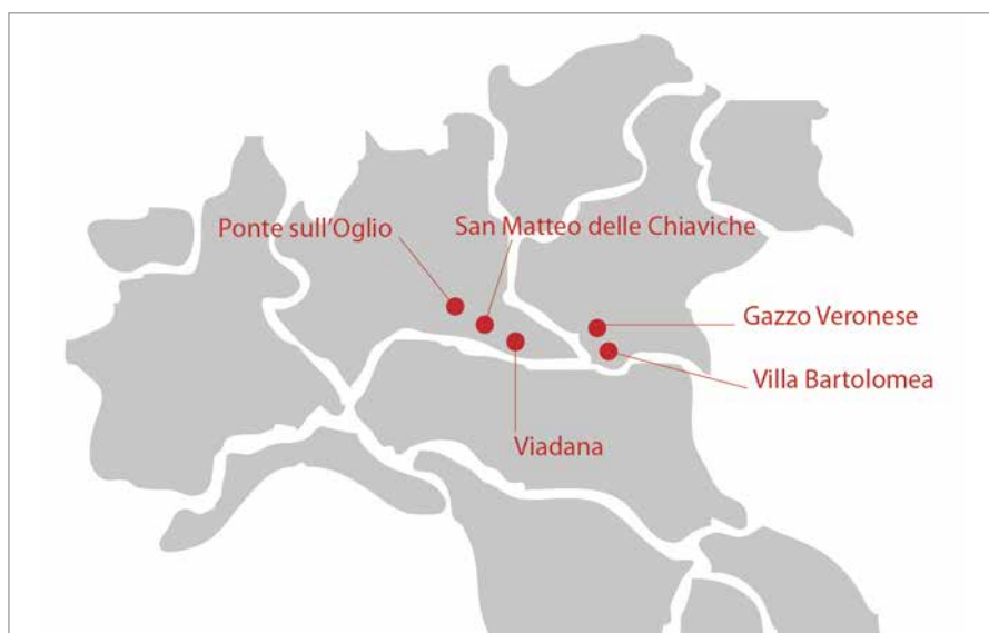
Figure 1 - Detail of the regions of northern Italy and geographical position of the polycyclic plantations included in this study.